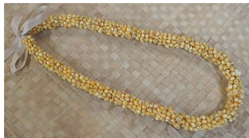
Yellow Mung Shell Lei