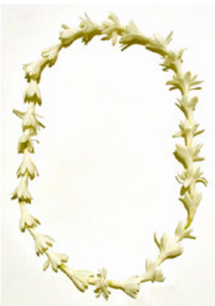
Tuberose - (Highly fragrant)

Feel like royalty when wearing these floral crowns. Composed of five downward pointing, twisted petals that mimic a miniature royal crown made this lei a favorite of Queen Liliuokalani. In addition, the flowers attract the monarch butterfly and tie in well with butterfly releases. Legend holds that "Kama the god of love shoots arrows of the crown flower buds into the heart."