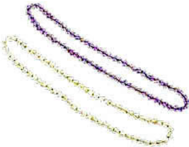
Puakalanunu Crown Flower - (No fragrance)

Truly stunning artisanship! Strung with only the lip of approximately 600 orchids, this lei is one of the most exquisite to be seen and worn.