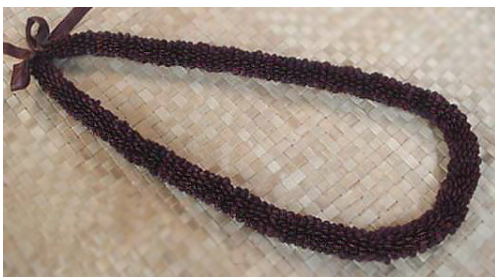
Koa Seed Lei

In remembrance of Laka, dancers familiar with the halau (school) hula offer these golden orange leis. Once reserved in historical times for High Chiefs (Kahunas) only, these slightly ruffled, tissue paper-like blossoms are a great choice for rich vibrant color. Picture depicts double sewn ilima.