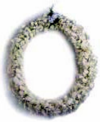
Double Hono Hono orchid lei – (No fragrance)

This lei is also available in plain white or solid purple. The photo depicts a double white dendrobium orchid lei.