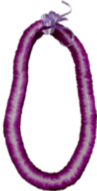
Christina style orchid lei – (No fragrance)

This lei is also available in plain white or solid purple. The photo depicts a double white dendrobium orchid lei.